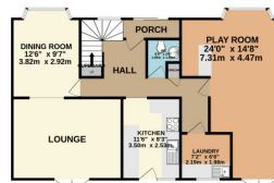
1ST FLOOR 699 sq. ft. (64.9 sq. m.) approx.