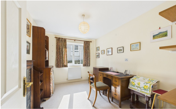
Bedroom Four / Study