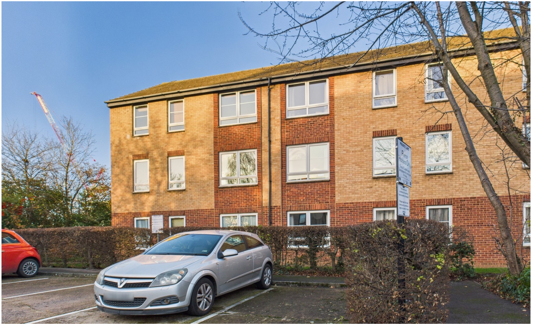
William Smith Close, Cambridge CB1 3QF