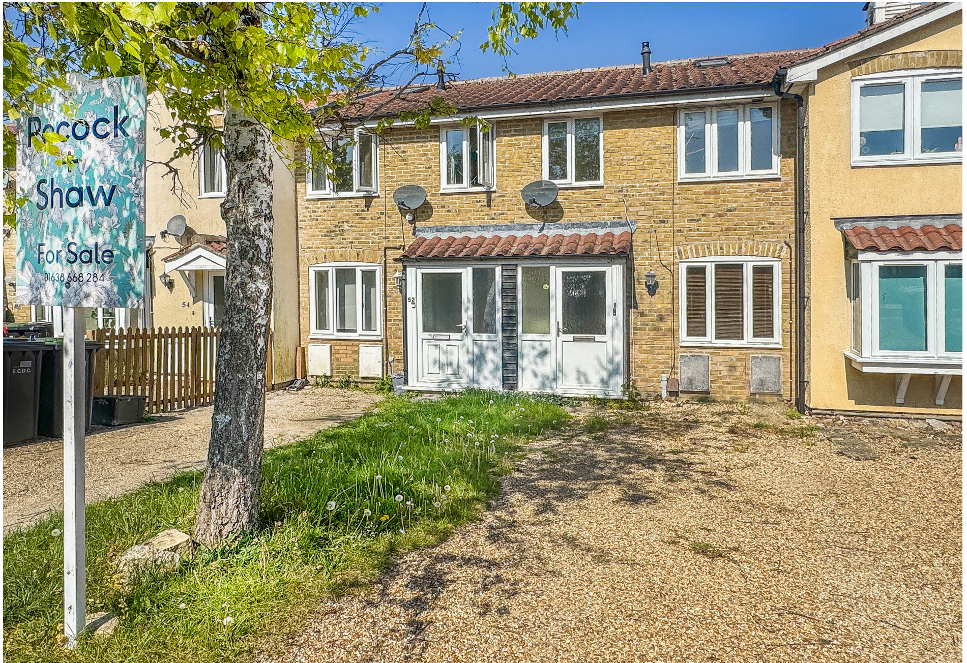
Bayfield Drive, Burwell