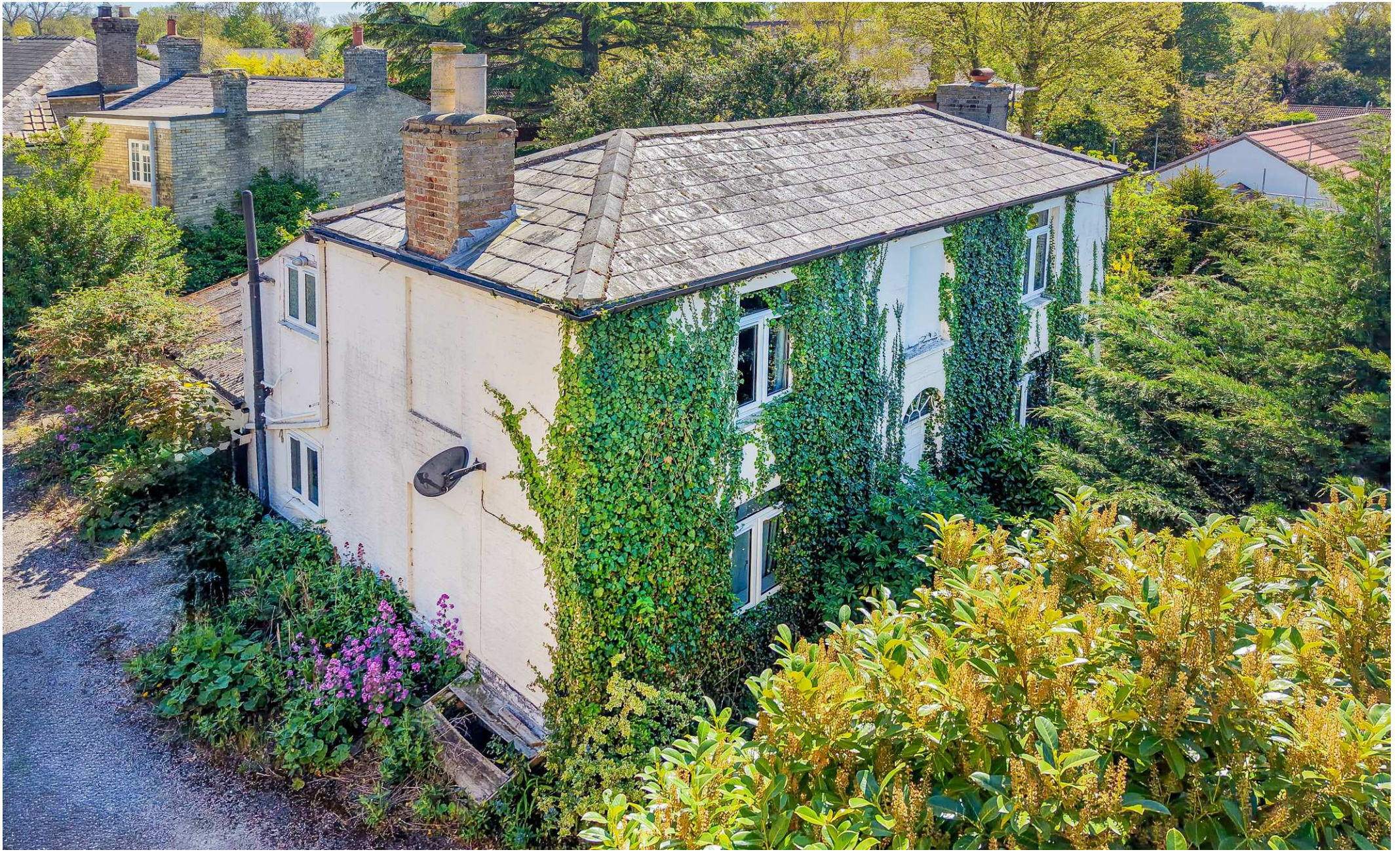
Mill Lane, Fordham