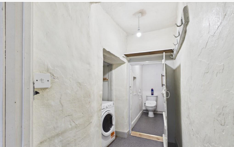
Downstairs WC and utility area