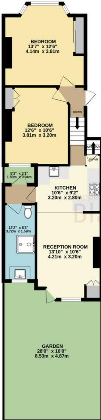
GROUND FLOOR 620 sq.ft. (57.6 sq.m.) approx.