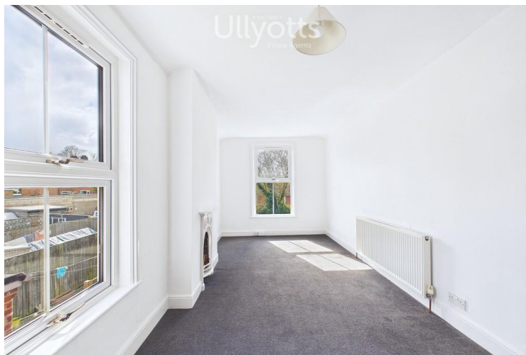
Bedroom 2/Dressing Room