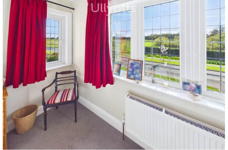
Bedroom 1 View