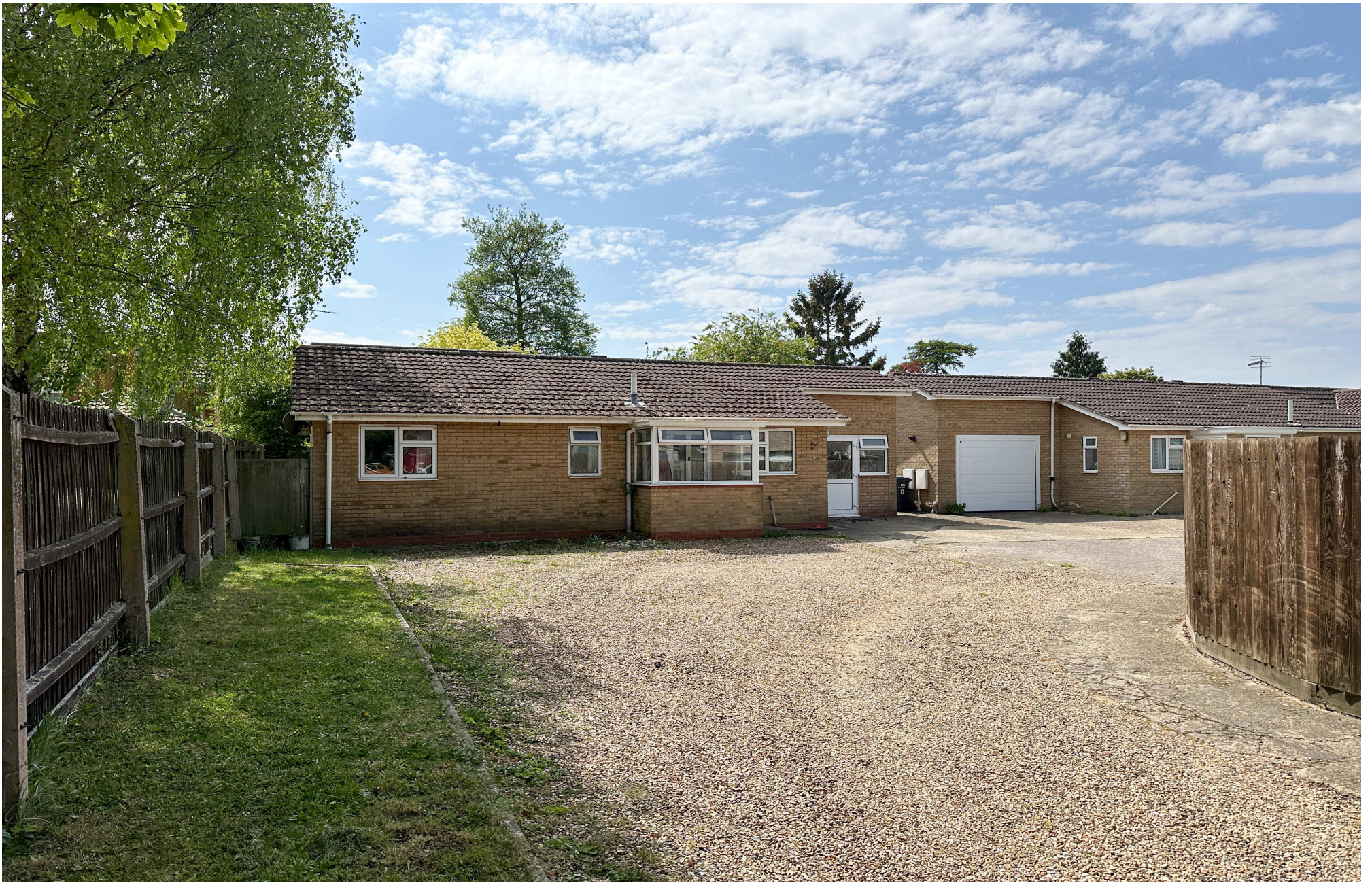
Chestnut Rise, Burwell Cambridgeshire