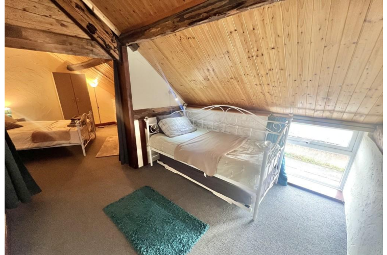
dressing room / Bedroom 5

Note: The property is situated next to Oaklands Farm. The seller has enjoyed uninterrupted access to the rear of the property over part of the farm for 20 years.