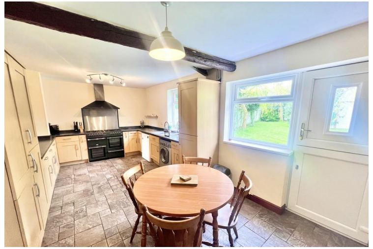
Kitchen / diner