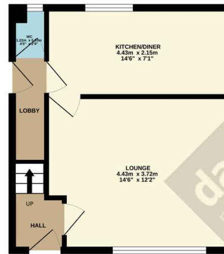
GROUND FLOOR 30.8 sq.m. (331 sq.ft.) approx.