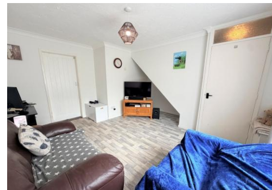
Yew Tree Rise, Pinewood, Ipswich, IP8 3RH