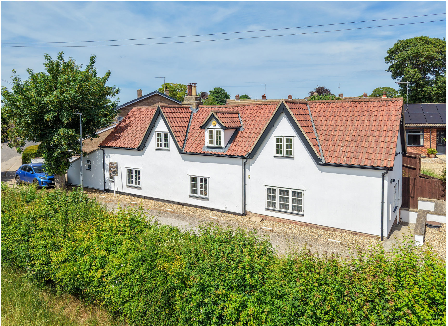
Spring Close Burwell Cambridgeshire