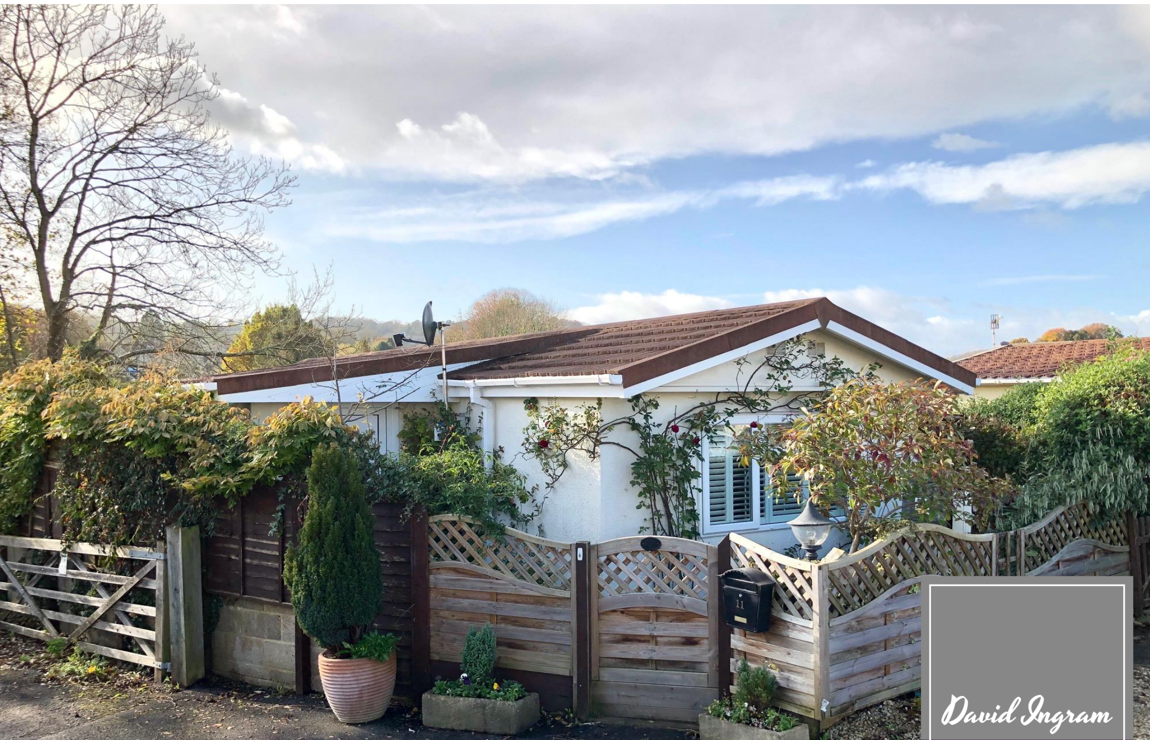
11 Lycetts Orchard, Box, Corsham, Wiltshire, SN13 8PJ