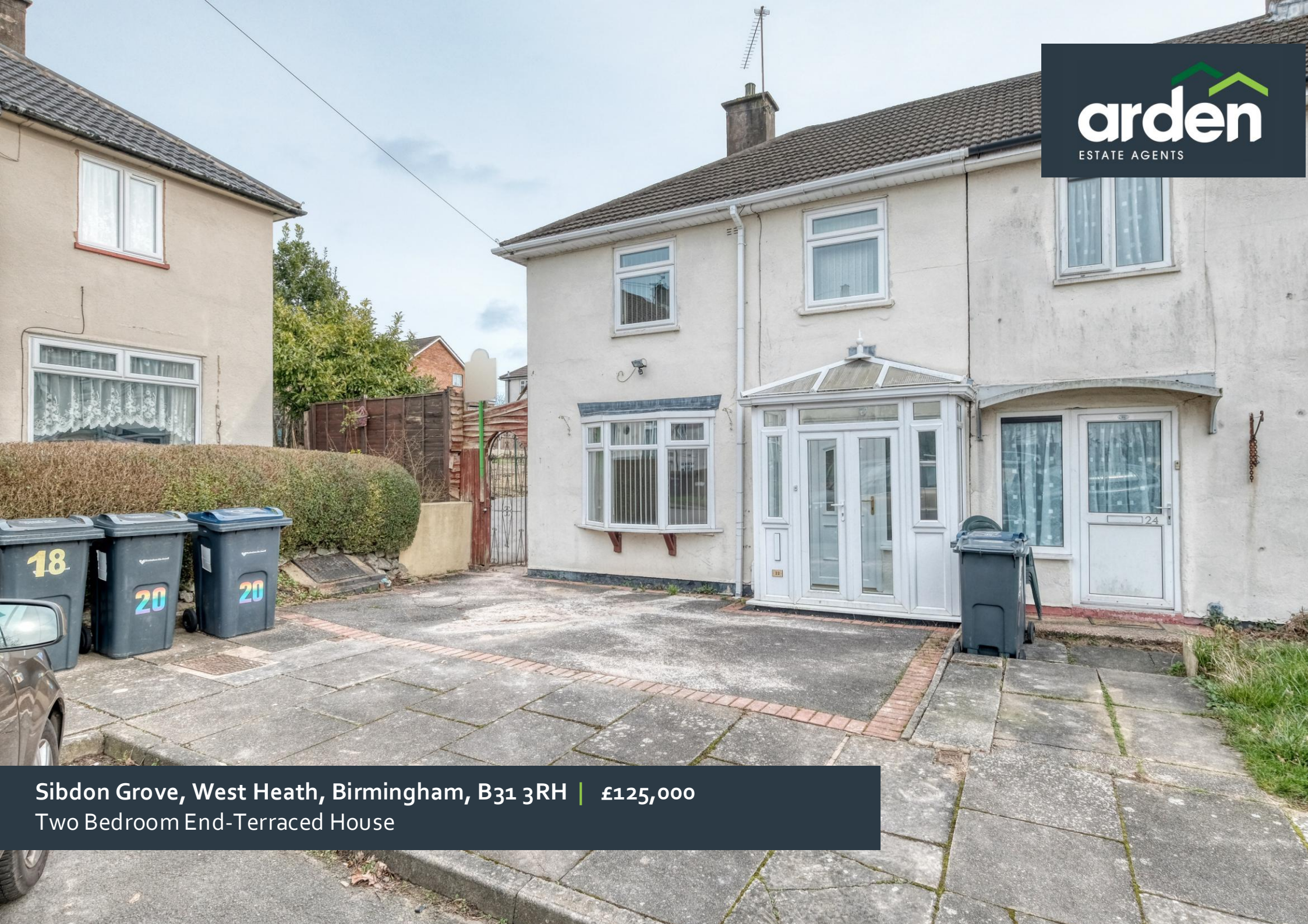
Sibdon Grove, West Heath, Birmingham, B31 3RH | £125,000 Two Bedroom End-Terraced House