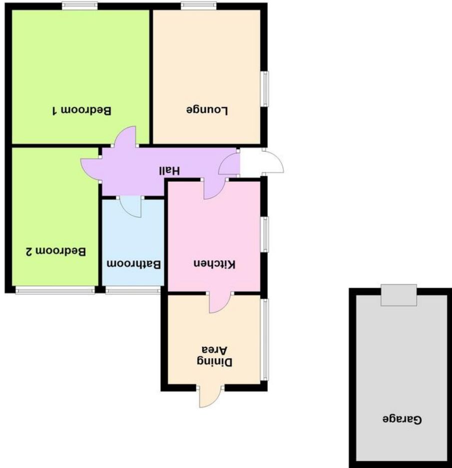
Ground Floor Approx. 782.0 sq. feet

If you require the full EPC certificate direct to your email address please contact the sales branch marketing this property and they will email the EPC certificate to you in a PDF format Please note that on occasion the EPC may not be available due to reasons beyond our control, the Regulations state that the EPC must be presented within 21 days of initial marketing of the property. Therefore we recommend that you regularly monitor our website or email us for updates. Please feel free to relay this to your Solicitor or License Conveyor.