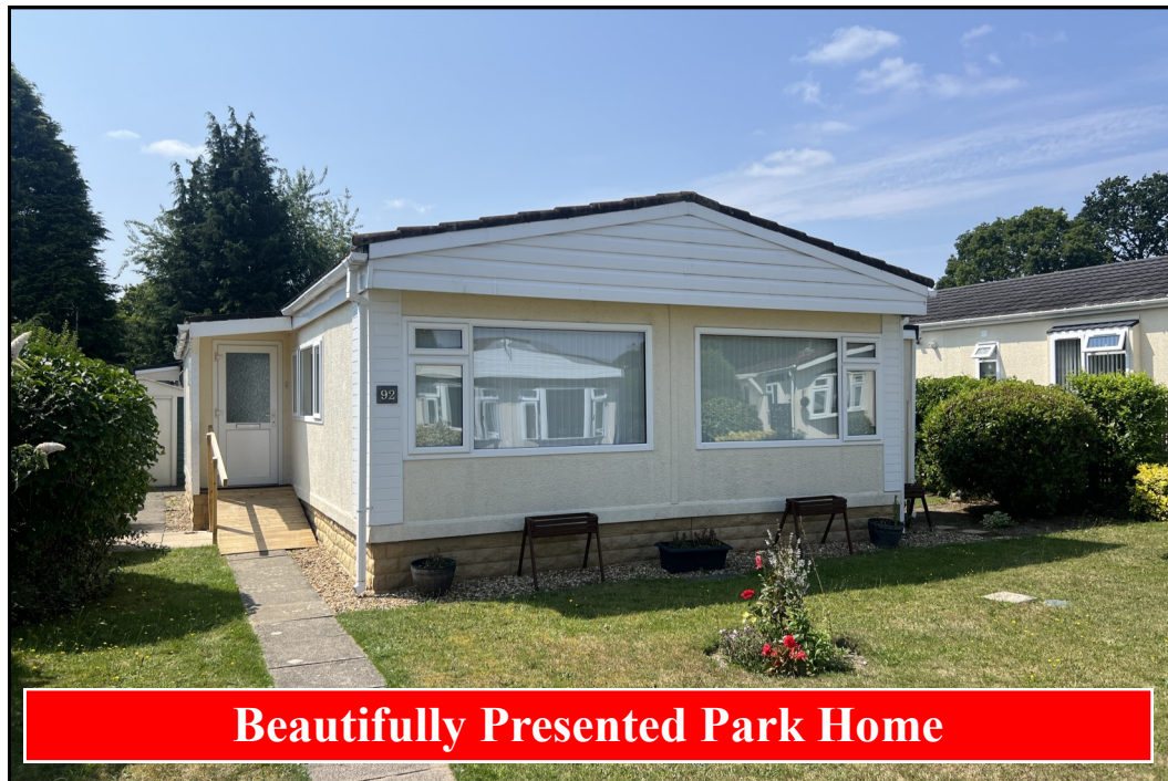
Beautifully Presented Park Home

92 St Leonards Farm Park, West Moors, Ferndown, Dorset. BH22 0AQ