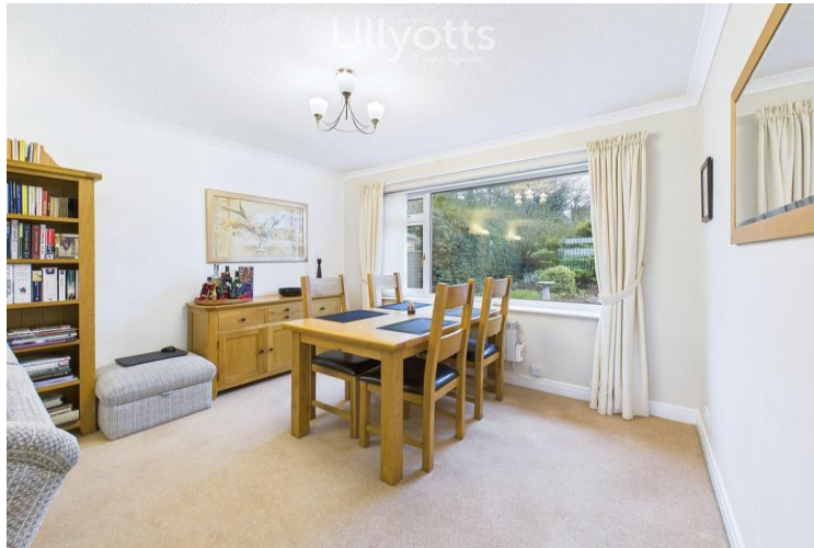
Lounge and Dining Room