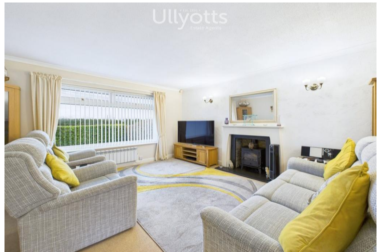
Lounge and Dining Room