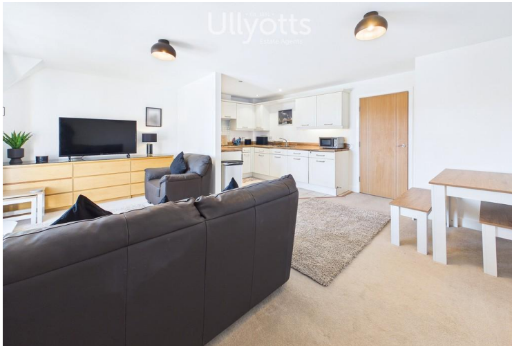
Lounge Kitchen Dining Area