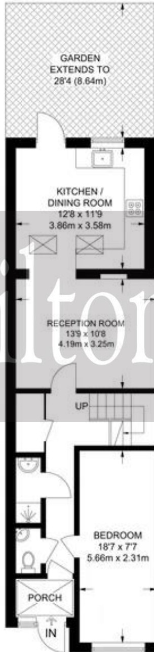
GROUND FLOOR 591 SQ FT / 54.9 SQ M