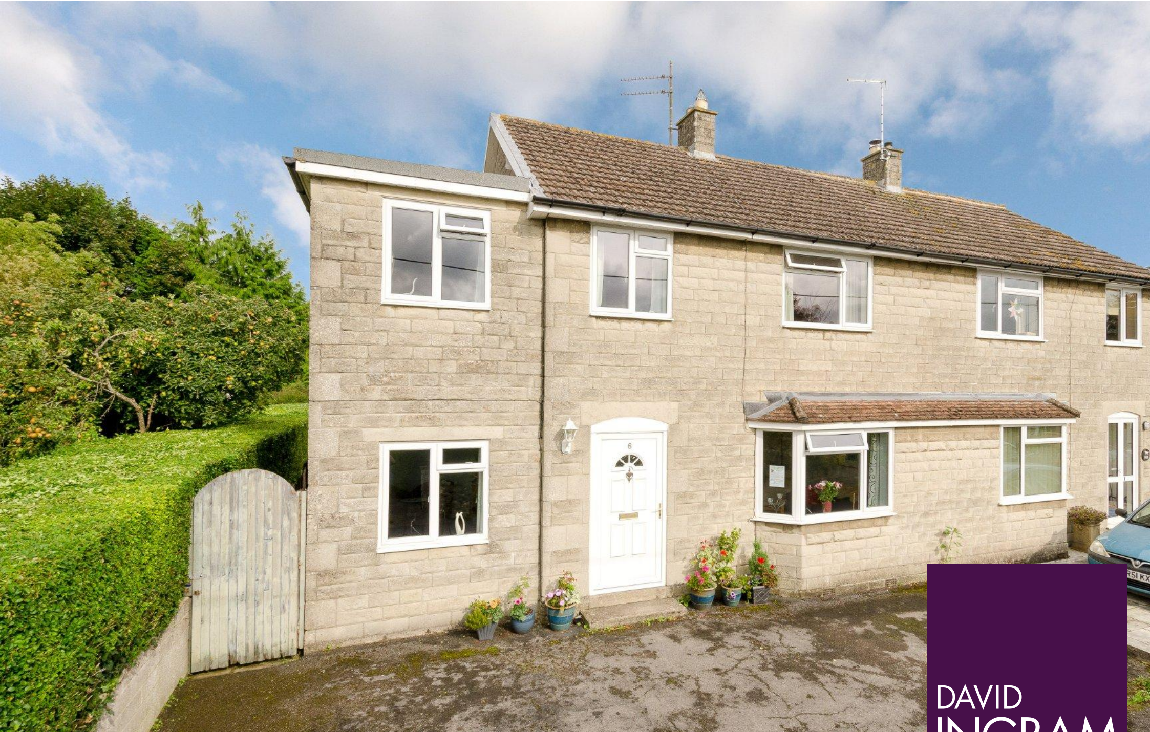
6 Providence Lane, Corsham, Wiltshire, SN13 9DJ