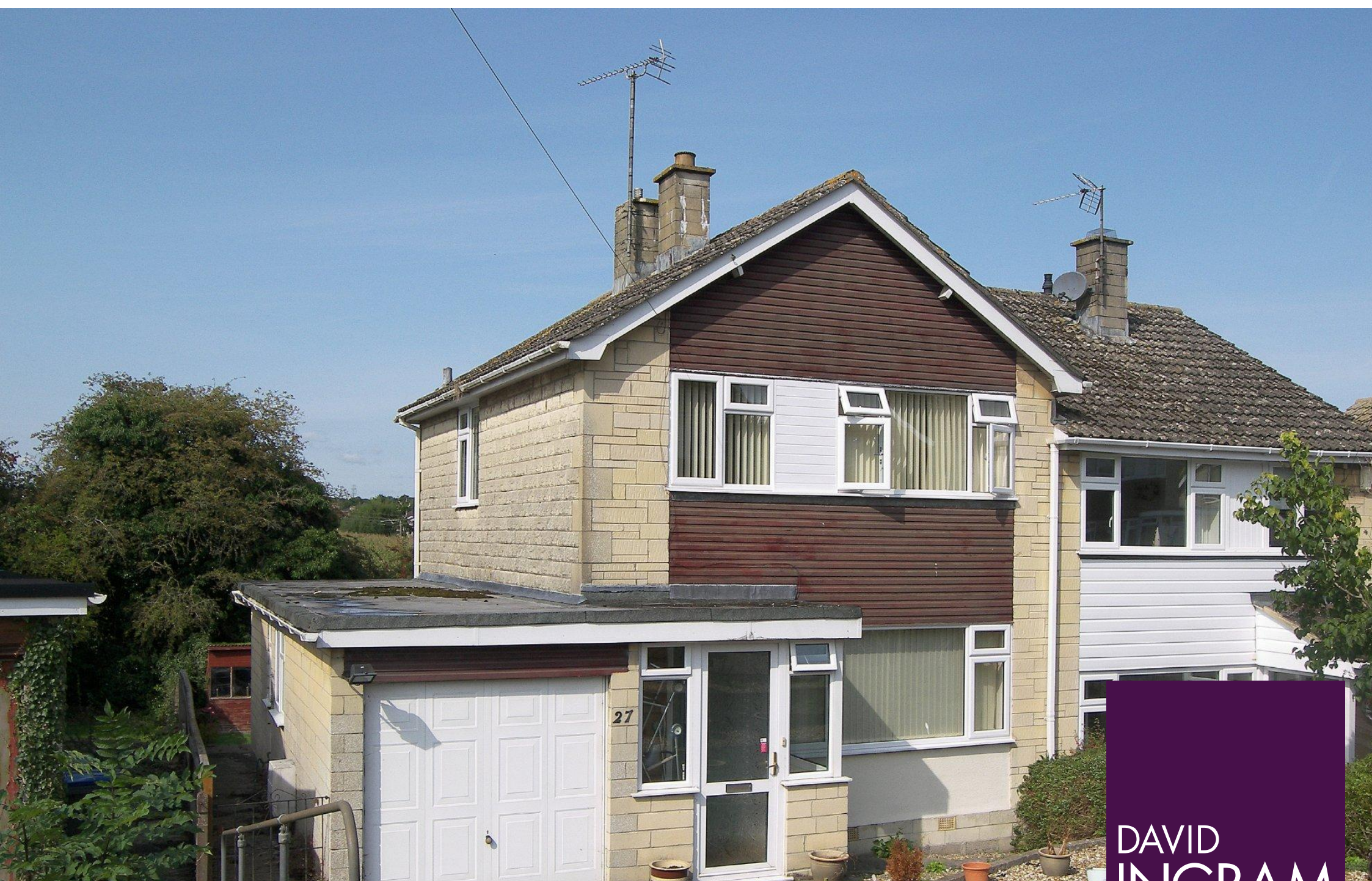
27 Tellcroft Close, Corsham, Wiltshire, SN13 9JH