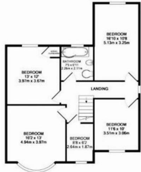
1ST FLOOR APPROX. FLOOR AREA 835 SQ. FT. (77.6 SQ. M.)

PARK CLOSE, HARROWWEALD, HA3 6EX TOTAL APPROX. FLOOR AREA 1956 SQ. FT. (181.7 SQ. M.) We (or every agent) has taken every care to ensure the accuracy of the floor plan contained here. Measurements of doors, windows, rooms and any other items are approximate and no responsibility is taken for any error, omission, or misstatement. This plan is for illustrative purposes only and should be used as such by any prospective purchaser. The services, systems and appliances shown have not been tested and no guarantee as to their operability or efficiency can be given. Made with Metreplan 12/013