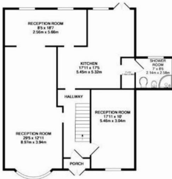
GROUND FLOOR APPROX. FLOOR AREA 1120 SQ. FT. (104.1 SQ. M.)