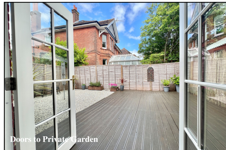
Doors to Private Garden