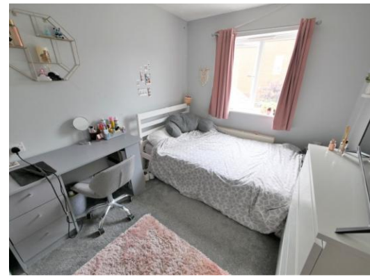
Dhobi Place, Ipswich, IP1 4QA