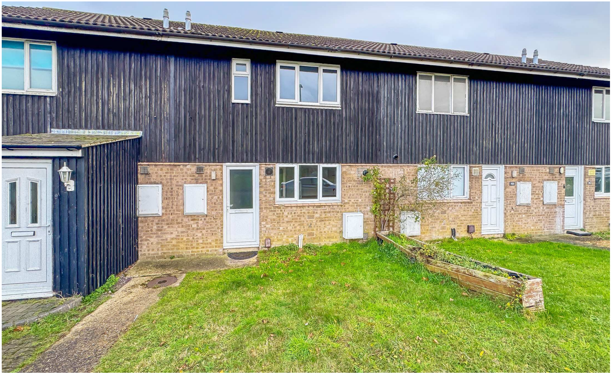
Nimbus Way, Newmarket, Suffolk