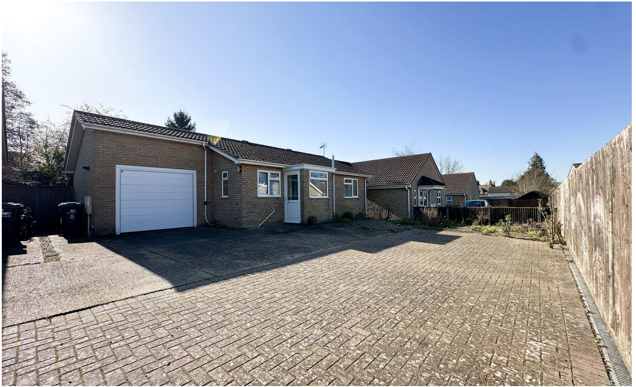
Chestnut Rise, Burwell