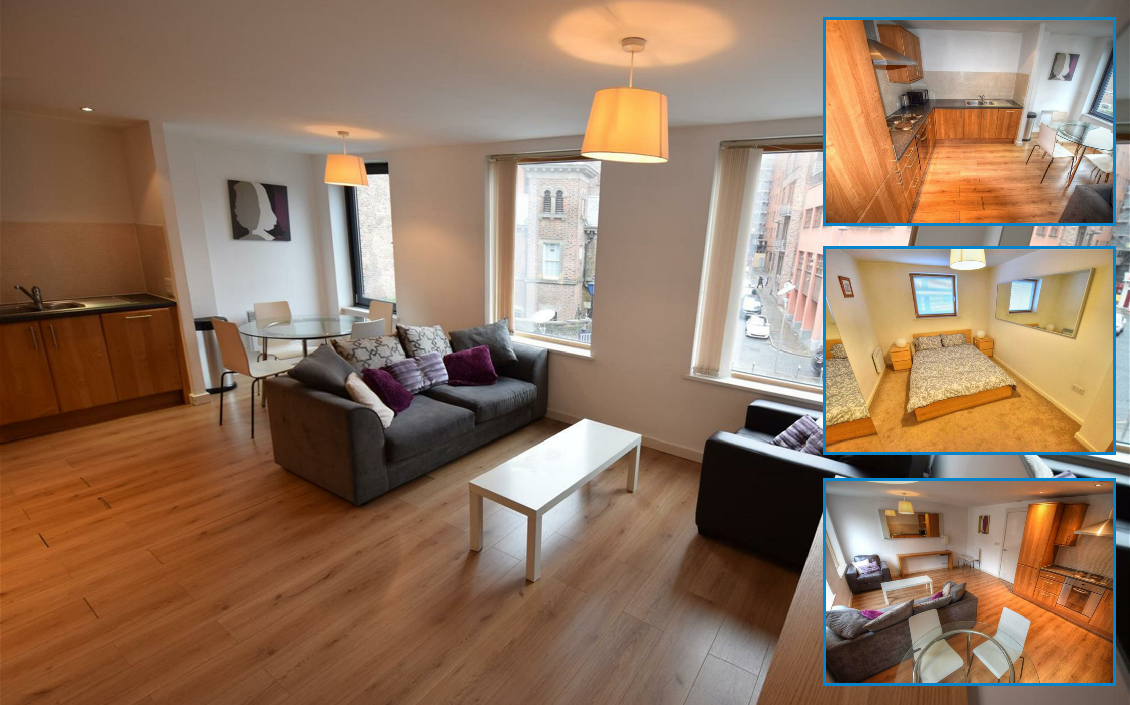
Apartment 22, 24 Argyle Street, Liverpool , L1 5DL £1,100