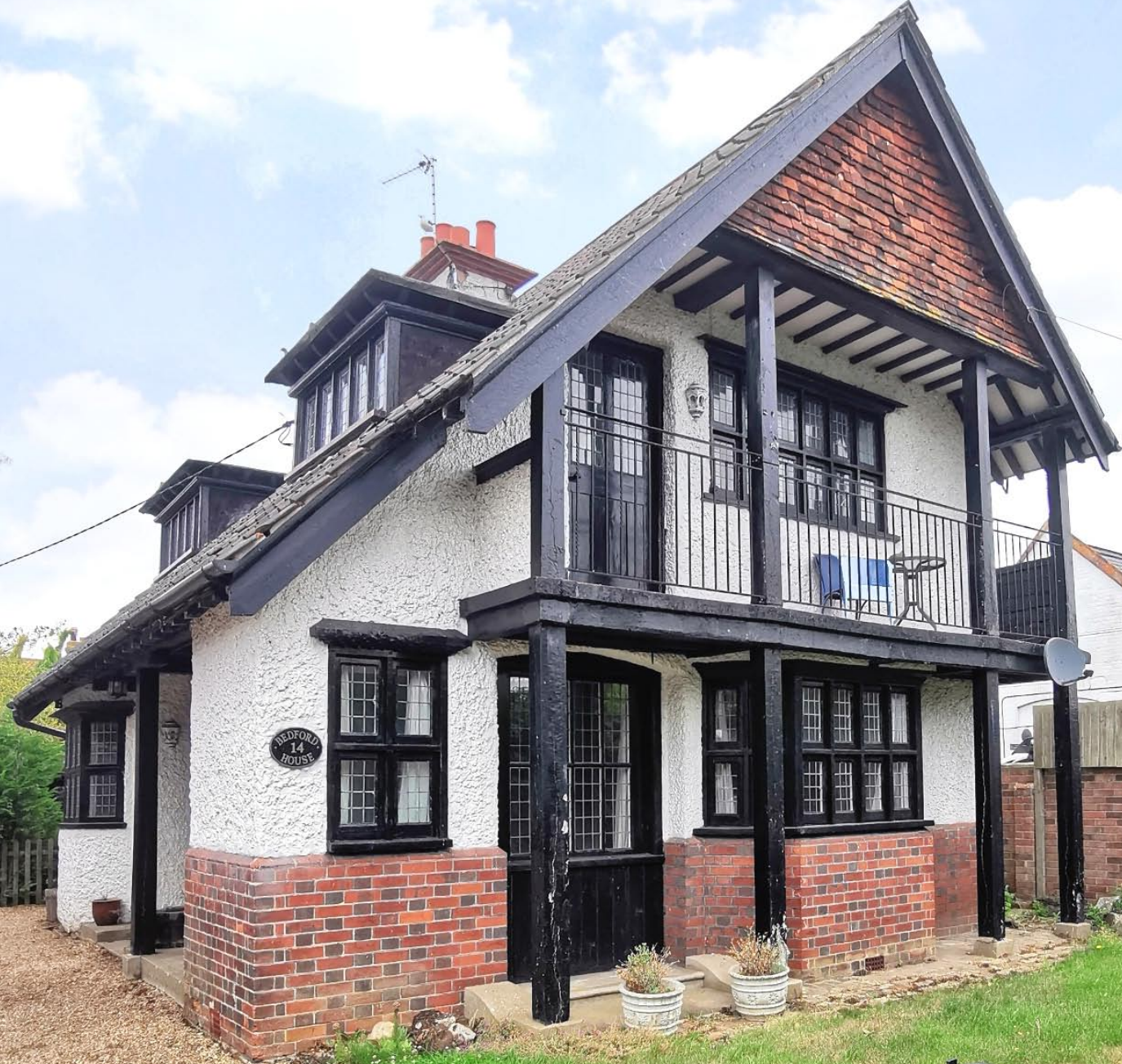
Bedford House Bungay, Suffolk.