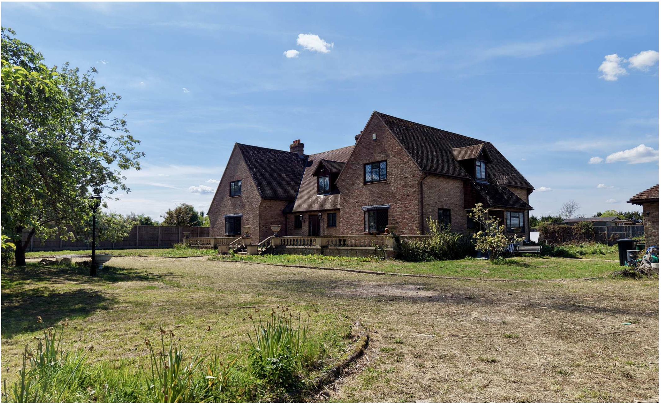
Rosewal Manor, Weirs Drove, Burwell