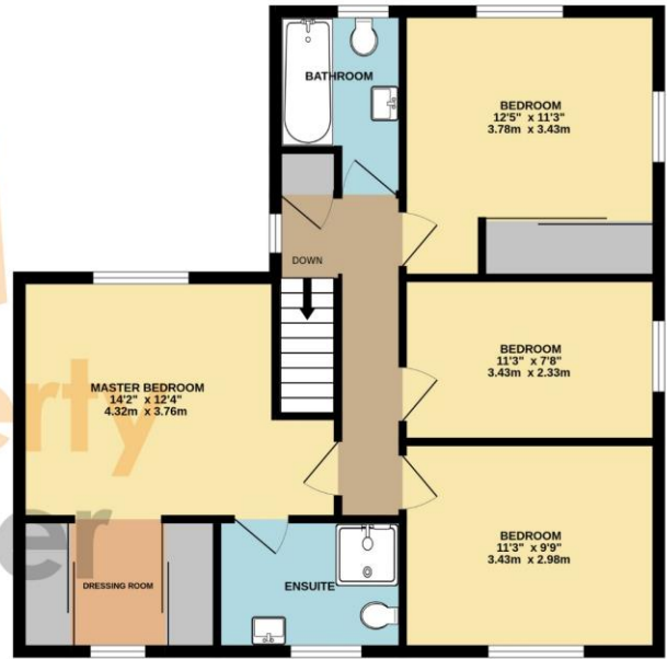
1ST FLOOR 742 sq.ft. (68.9 sq.m.) approx.