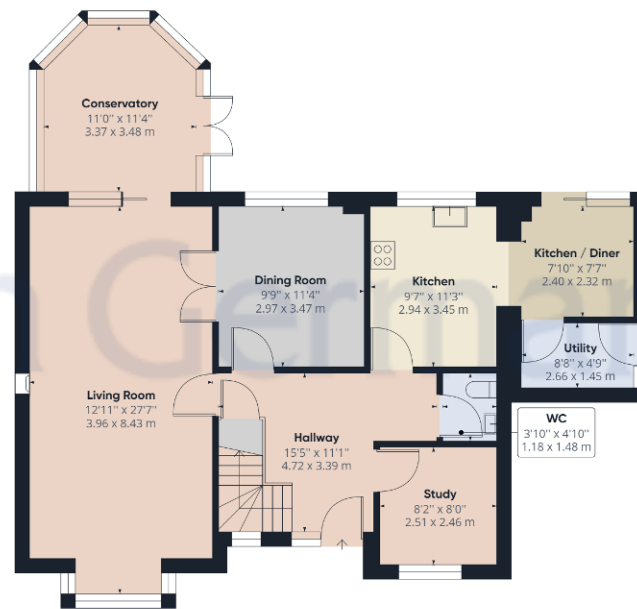
Ground Floor Building 1