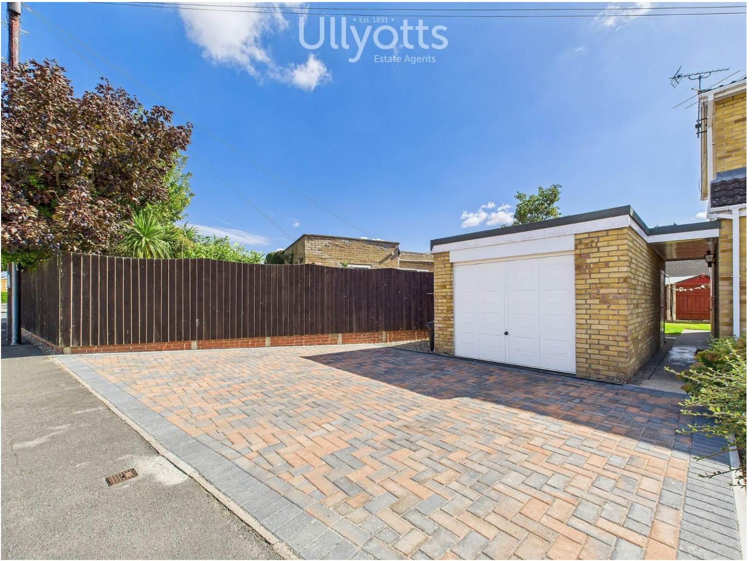
Parking & single garage