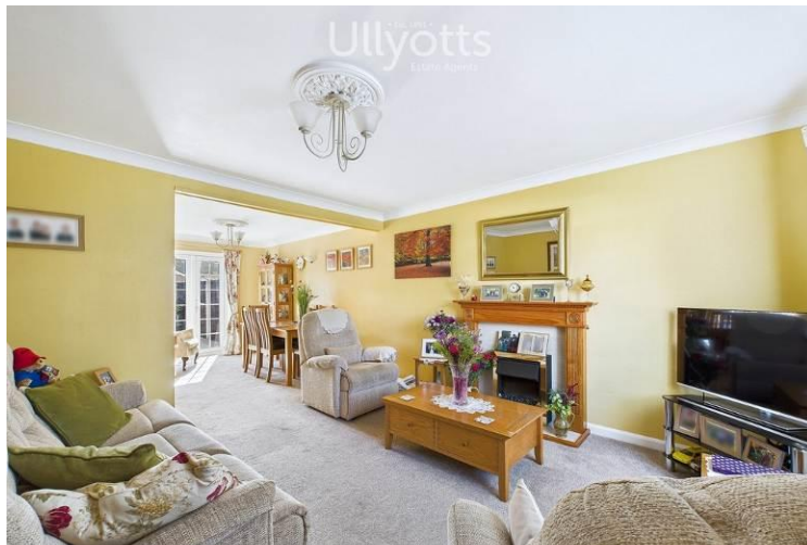
Lounge & Dining Area