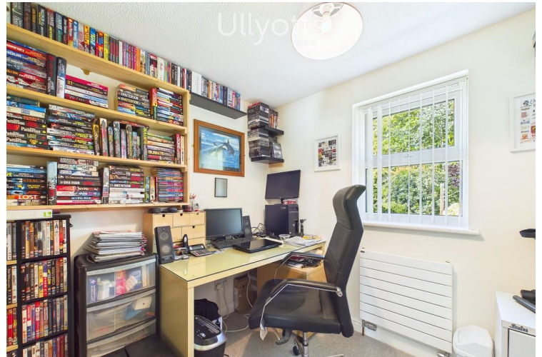
Bedroom 3 / Study