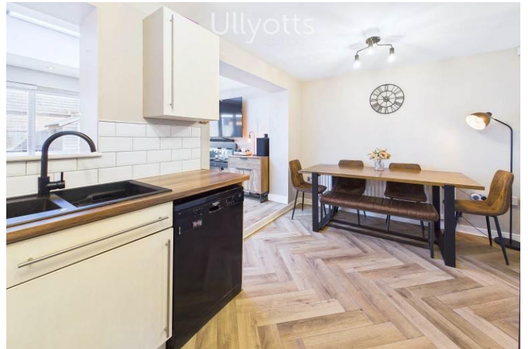
Kitchen /Dining Area