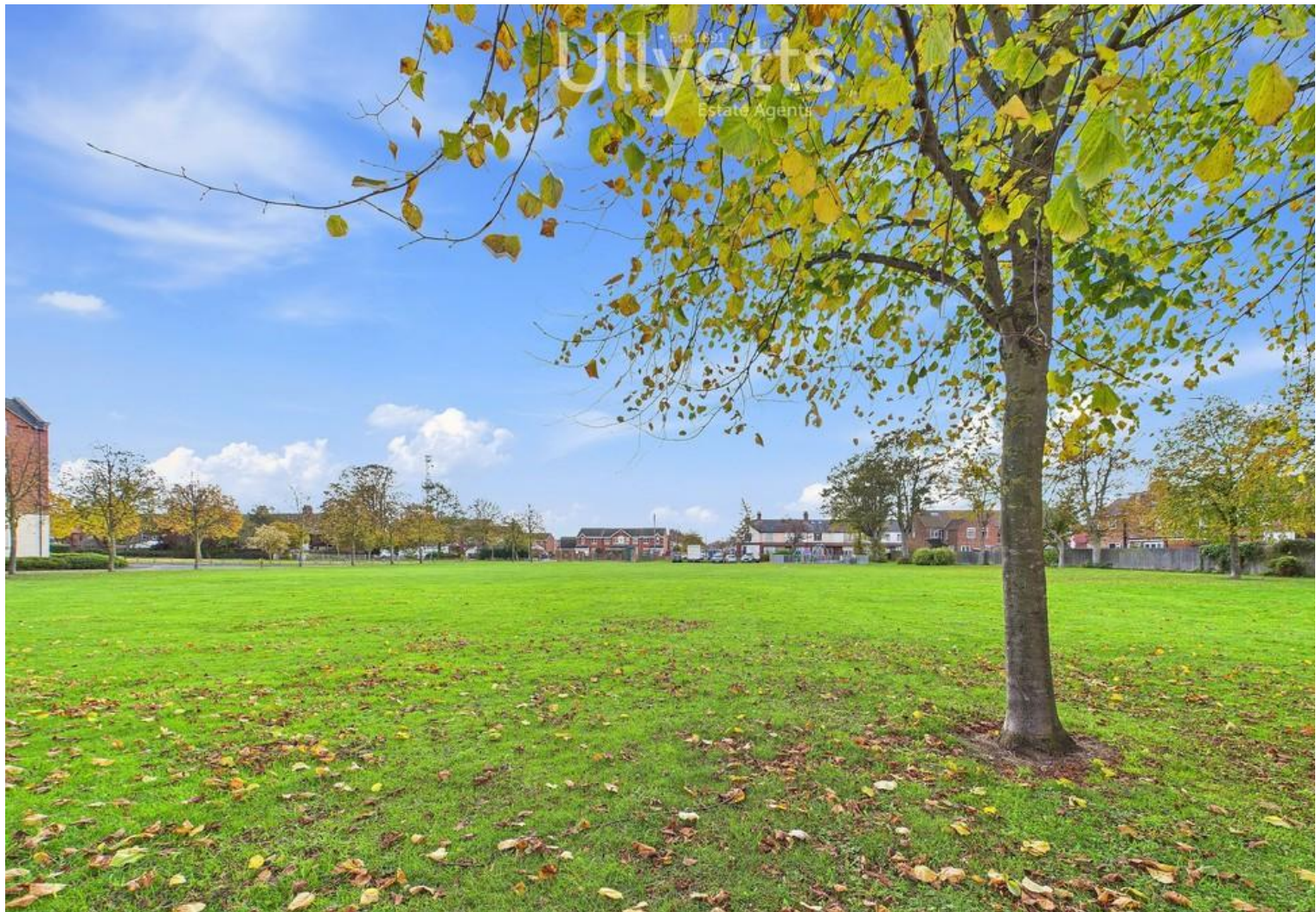
View from Property