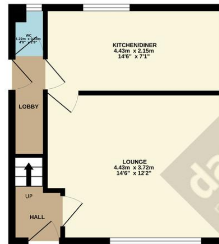
GROUND FLOOR 30.8 sq.m. (331 sq.ft.) approx.