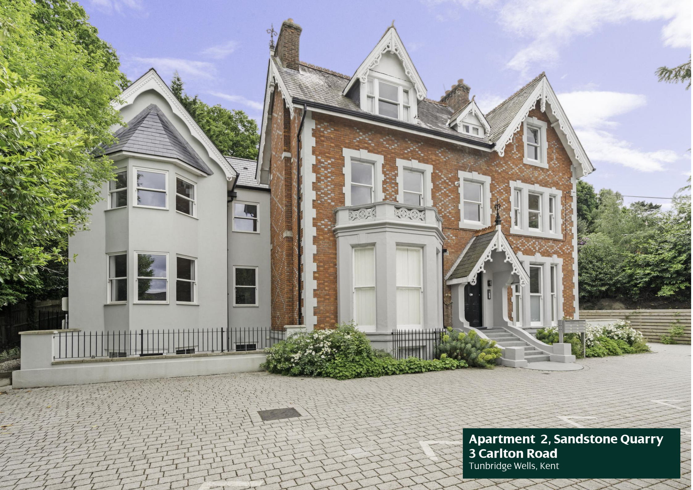
Apartment 2, Sandstone Quarry 3 Carlton Road Tunbridge Wells, Kent