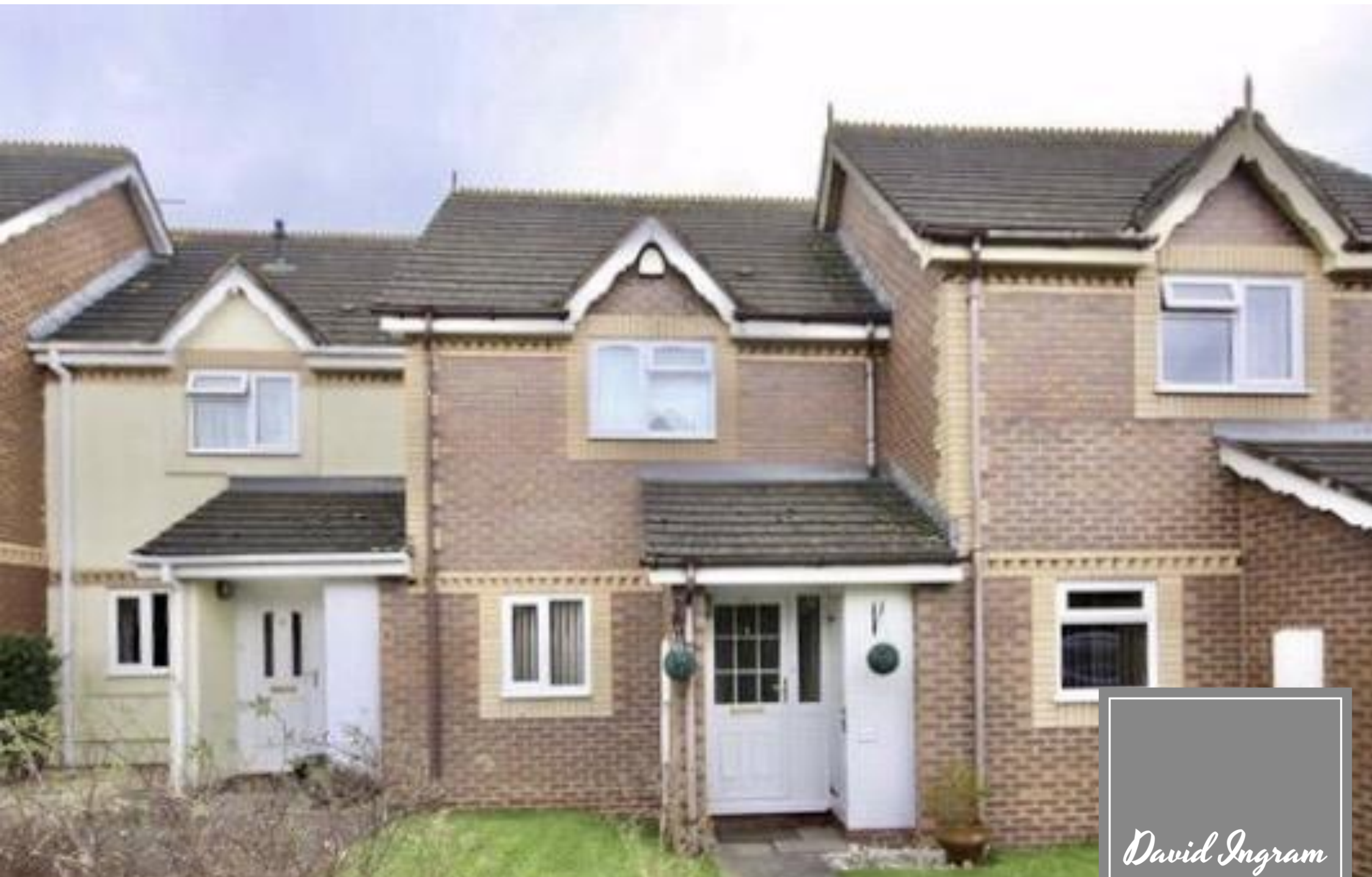
17 Pewsham Lock, Pewsham, Chippenham, Wiltshire, SN15 3GH