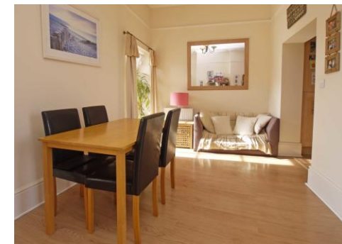
Epc to follow

Whilst every attempt has been made to ensure the accuracy of the floorplan contained here, measurements of doors, windows, rooms and any other items are approximate and no responsibility is taken for any error, omission or mis-statement. This plan is for illustrative purposes only and should be used as such by any prospective purchaser. The services, systems and appliances shown have not been tested and no guarantee as to their operability or efficiency can be given. Made with Metropix ©2020