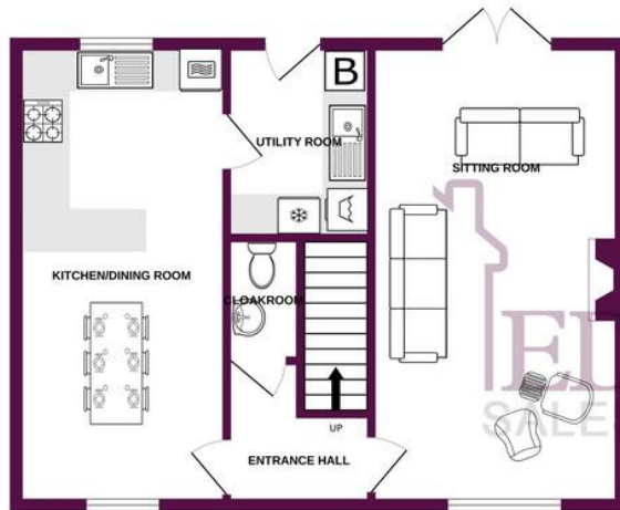
GROUND FLOOR 573 sq.ft. (53.2 sq.m.) approx.