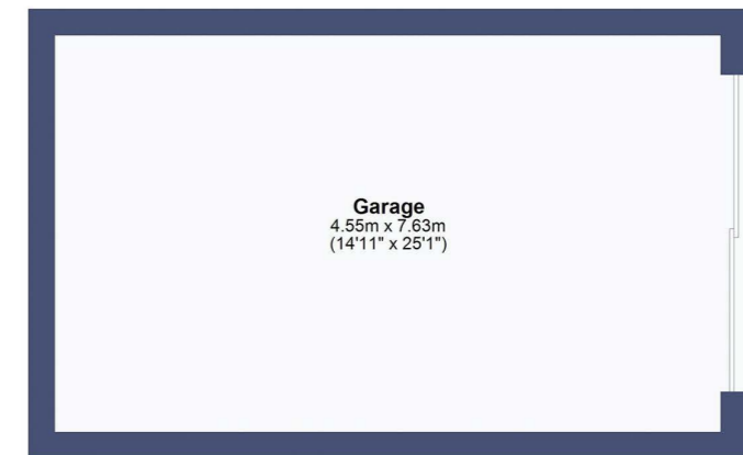
Outbuilding Approx. 34.8 sq. metres (374.2 sq. feet)