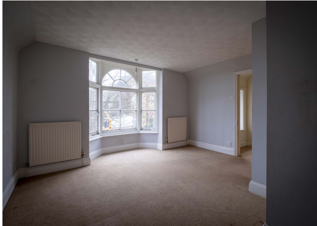
Further Bay fronted bedroom