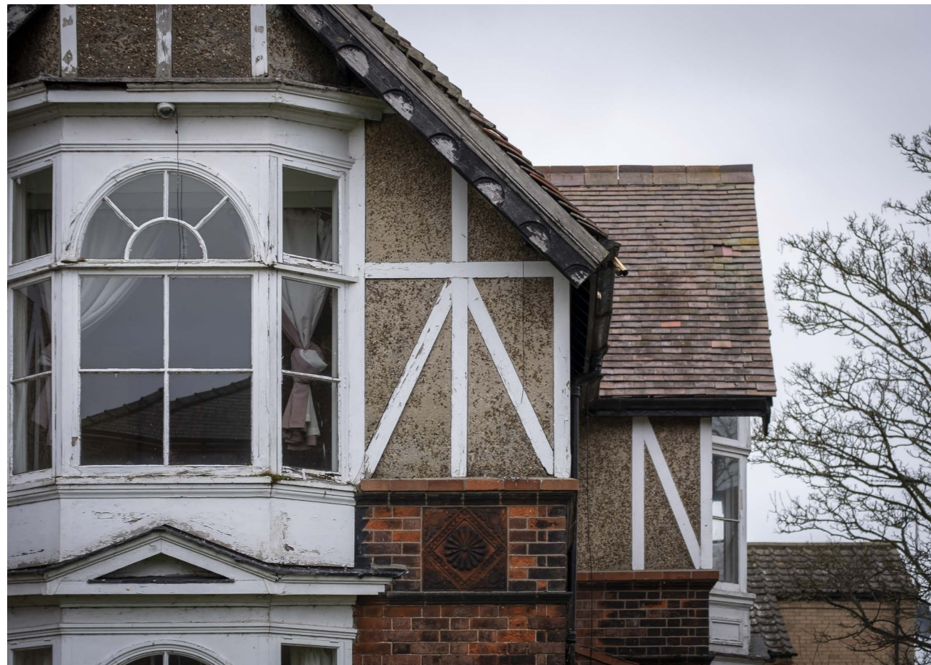
Many character features