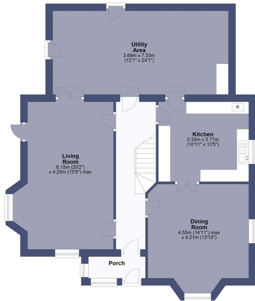
Ground Floor Approx. 94.5 sq. metres (1017.4 sq. feet)