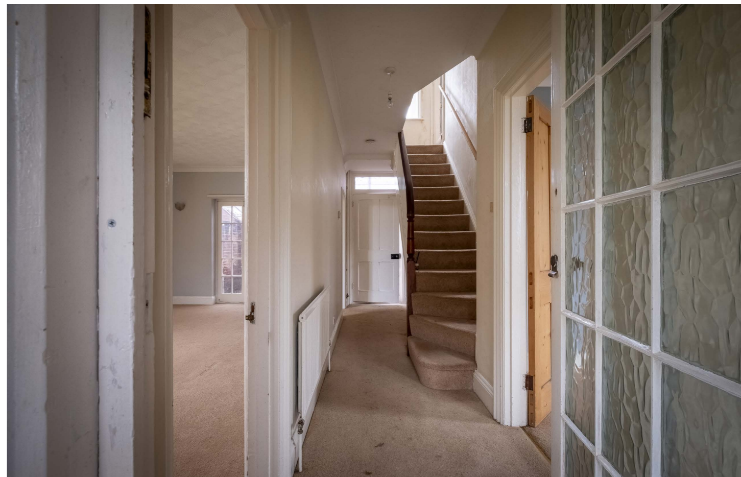
Entrance hall and view into living room