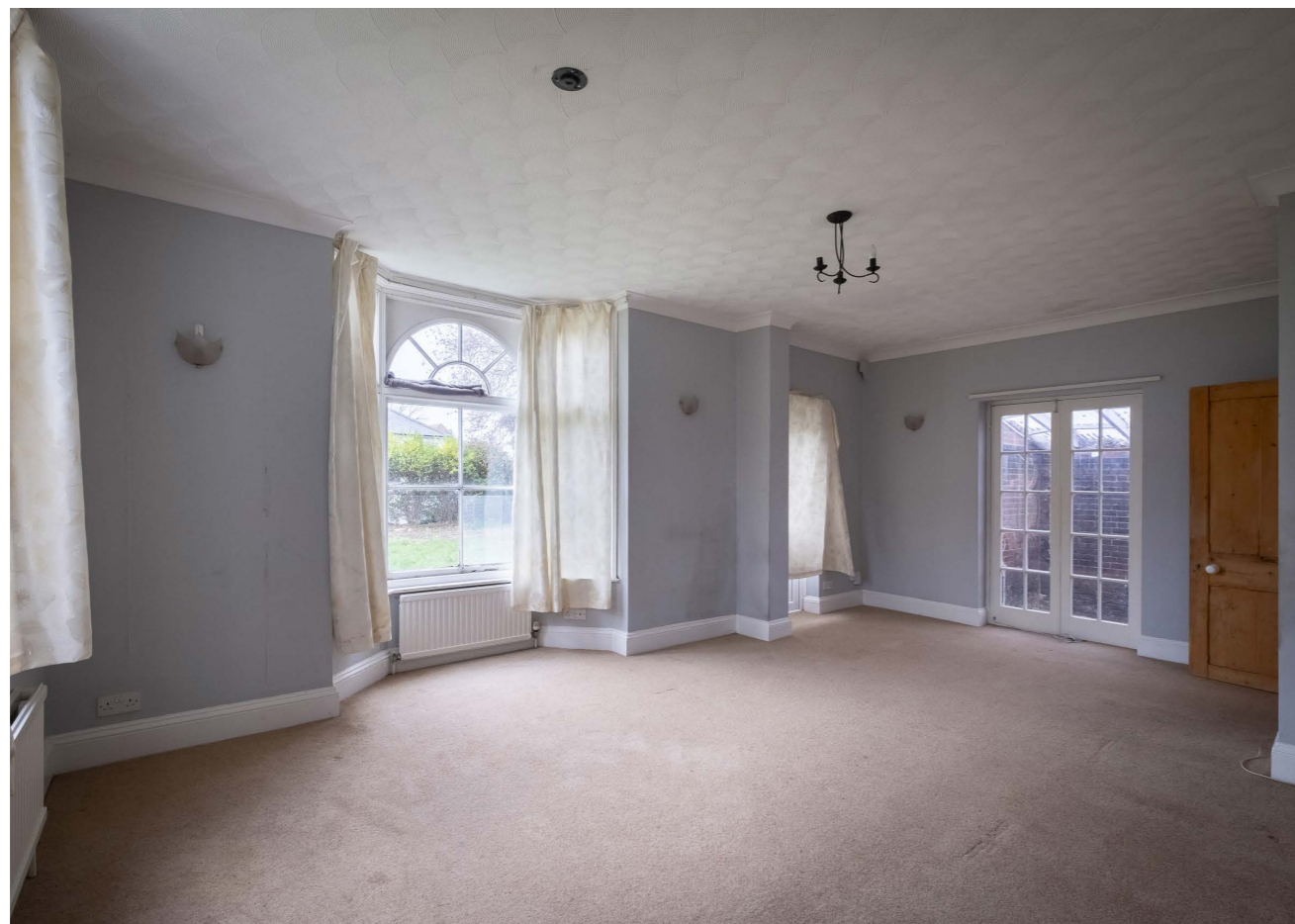
Sun filled living room