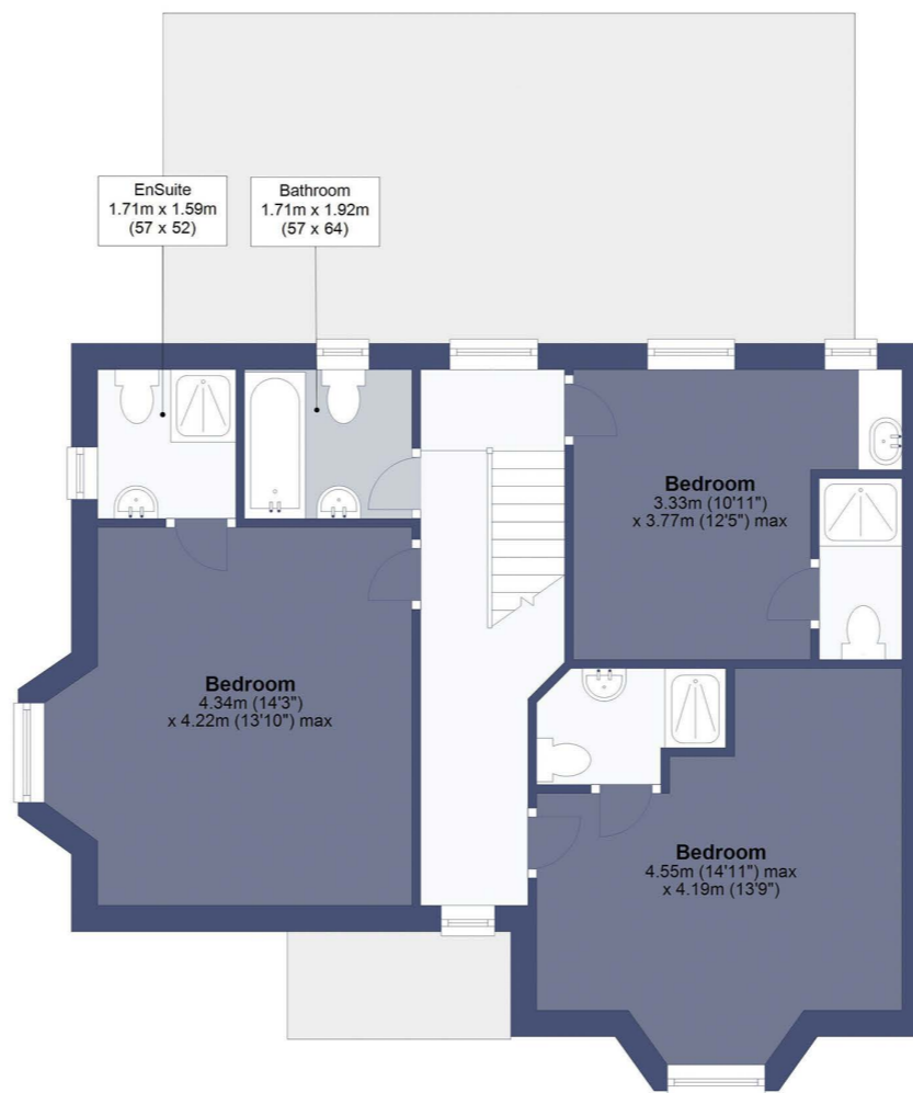
First Floor Approx. 63.7 sq. metres (686.2 sq. feet)