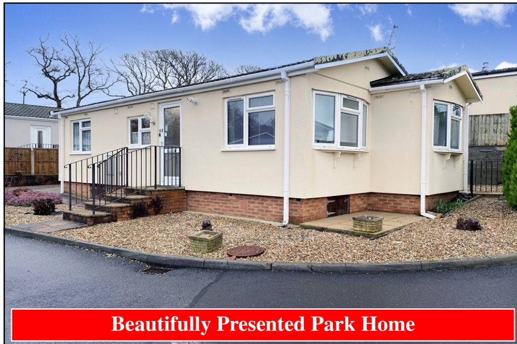
Beautifully Presented Park Home

40 Glendene Park, Bashley Cross Road, New Milton. BH25 5TA