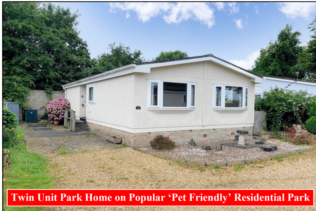
Twin Unit Park Home on Popular 'Pet Friendly' Residential Park

29 Oaklands Park, Crossways, Dorchester. DT2 8JQ