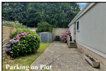
Parking on Plot