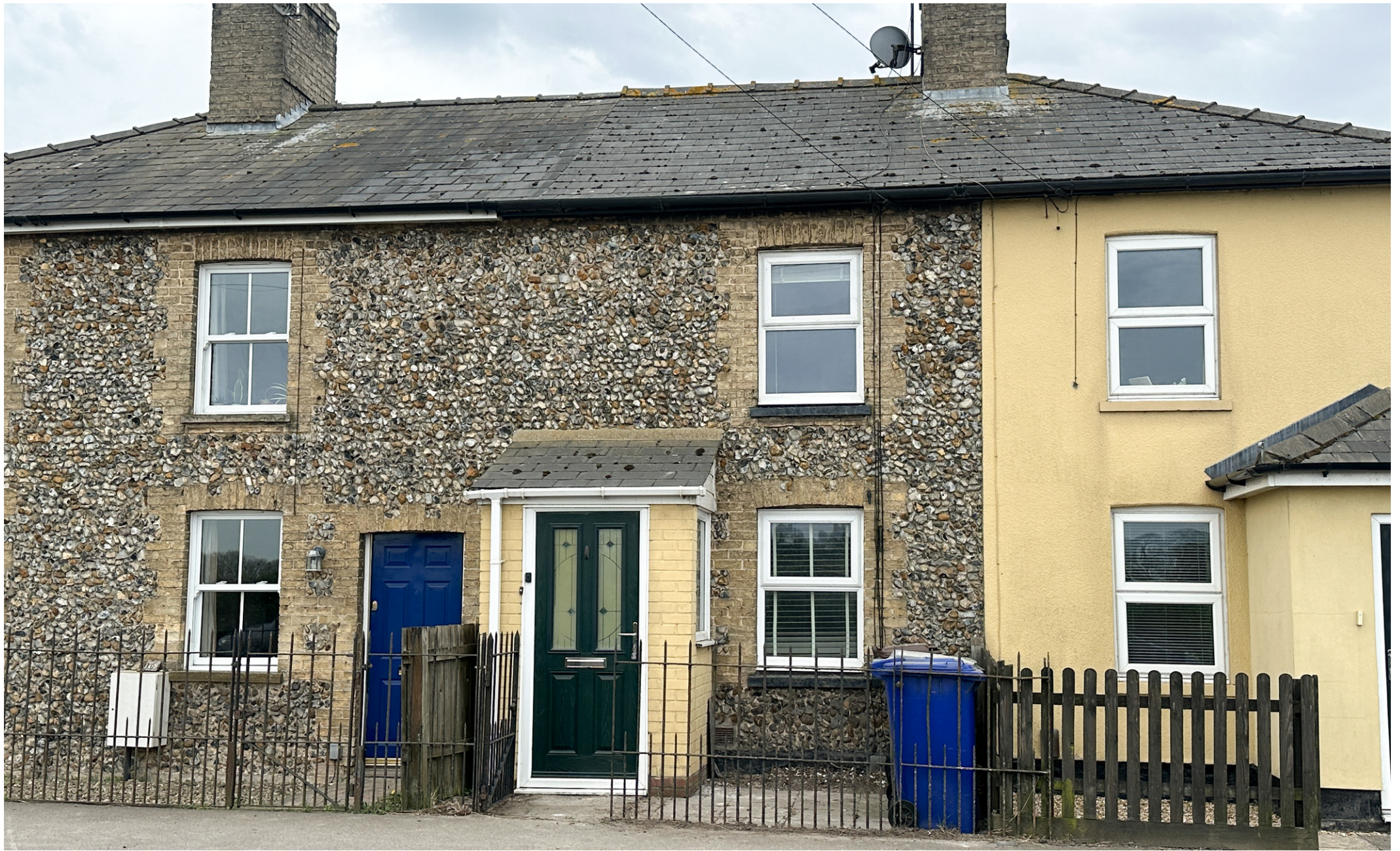
Burwell Road, Exning, Newmarket