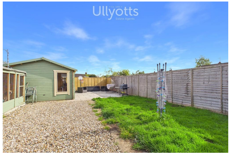
Garden with summerhouse