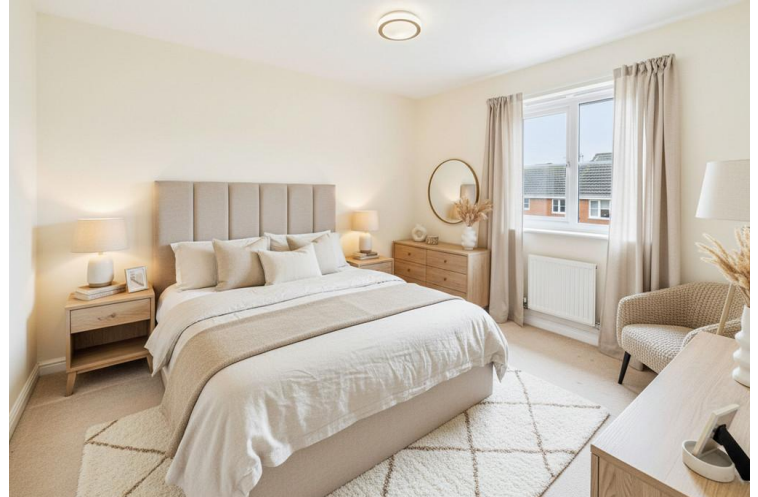
Virtually Staged Bedroom 2