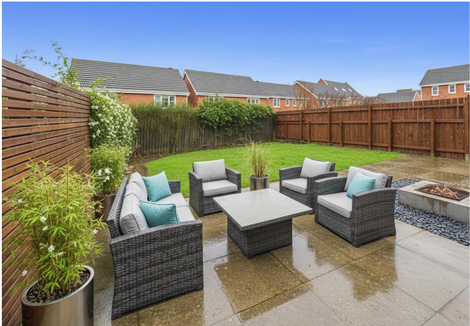
Virtually Staged Garden