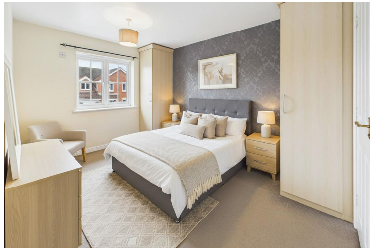
Virtually staged Bedroom 1