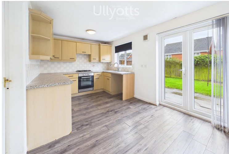
Kitchen Dining Area