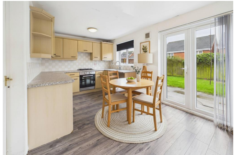
Virtually Staged Kitchen Dining Area