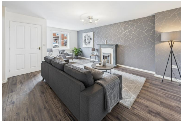
Virtually Staged Lounge