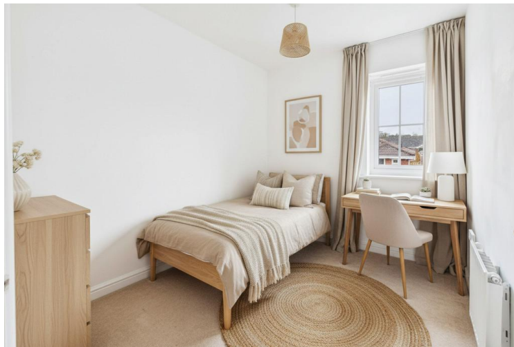
Virtually Staged Bedroom 3