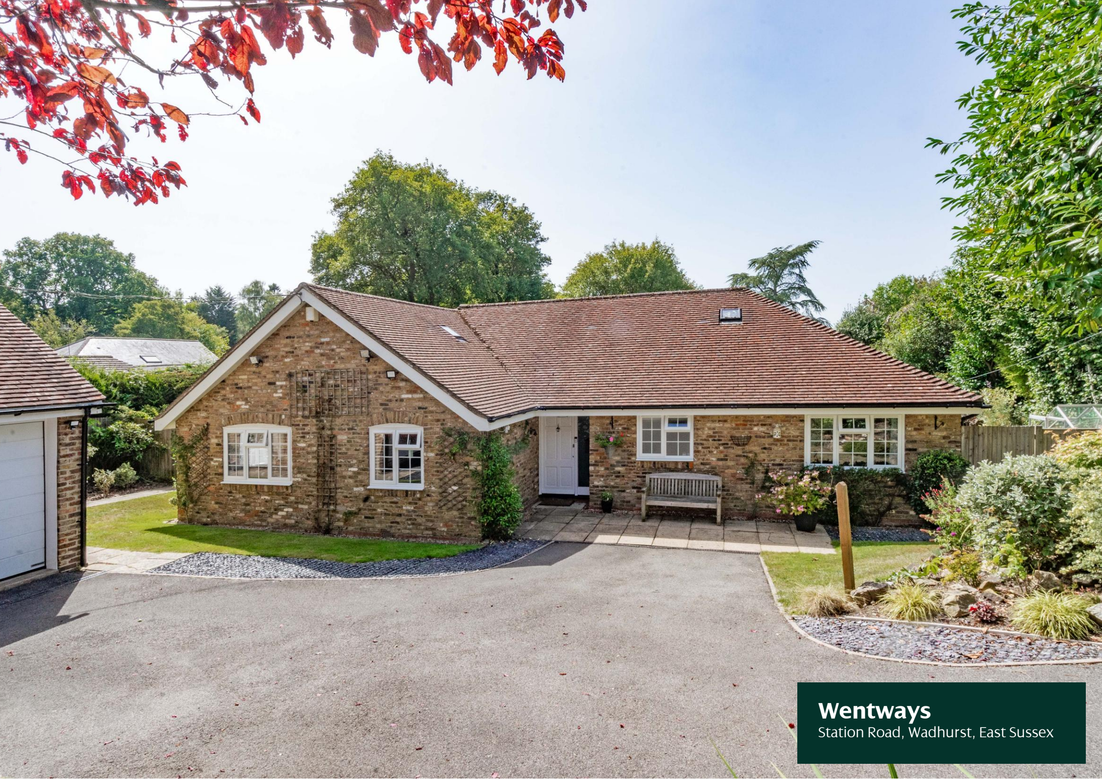
Wentways Station Road, Wadhurst, East Sussex