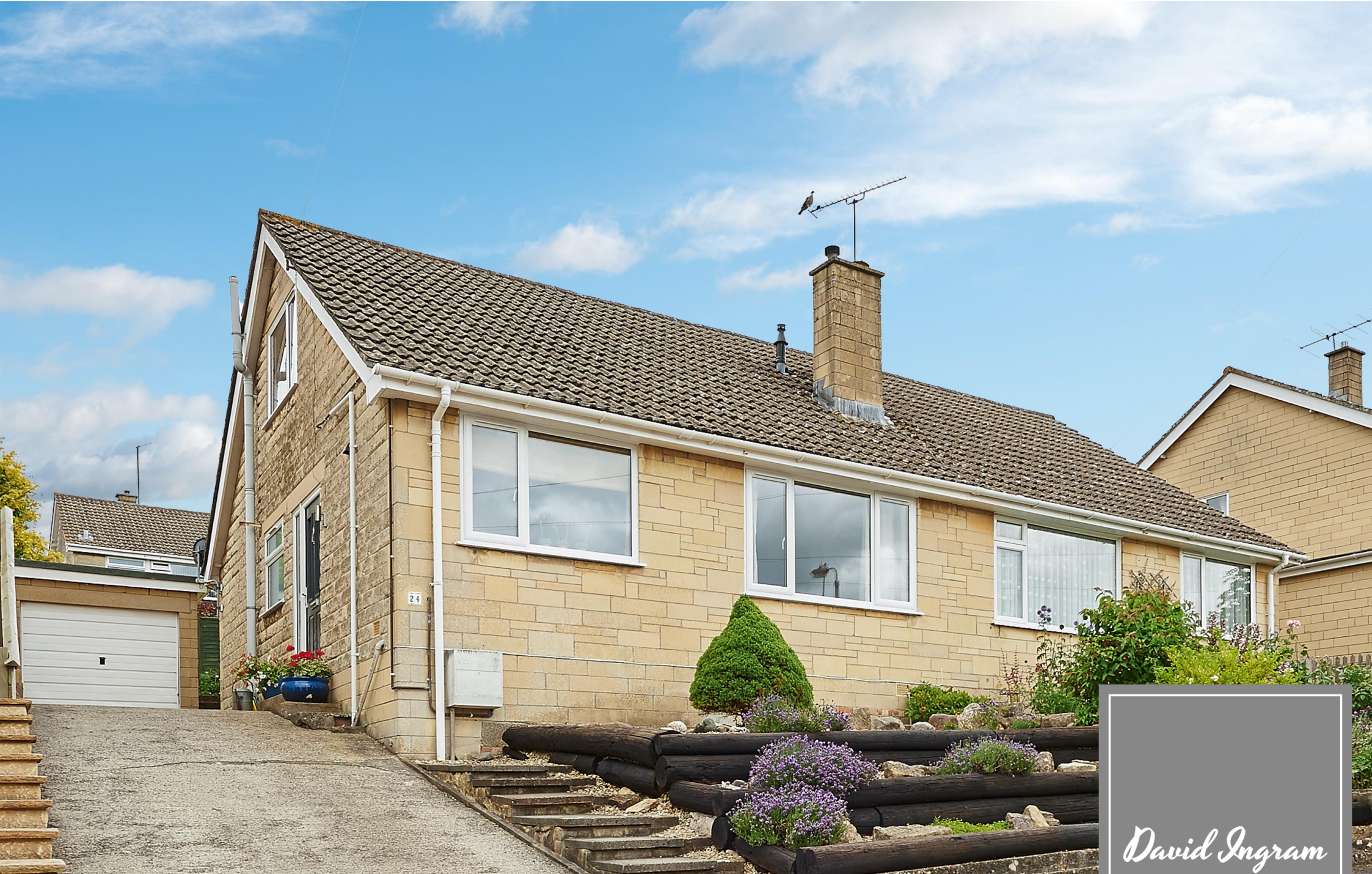
24 Tellcroft Close, Corsham, Wiltshire, SN13 9JH