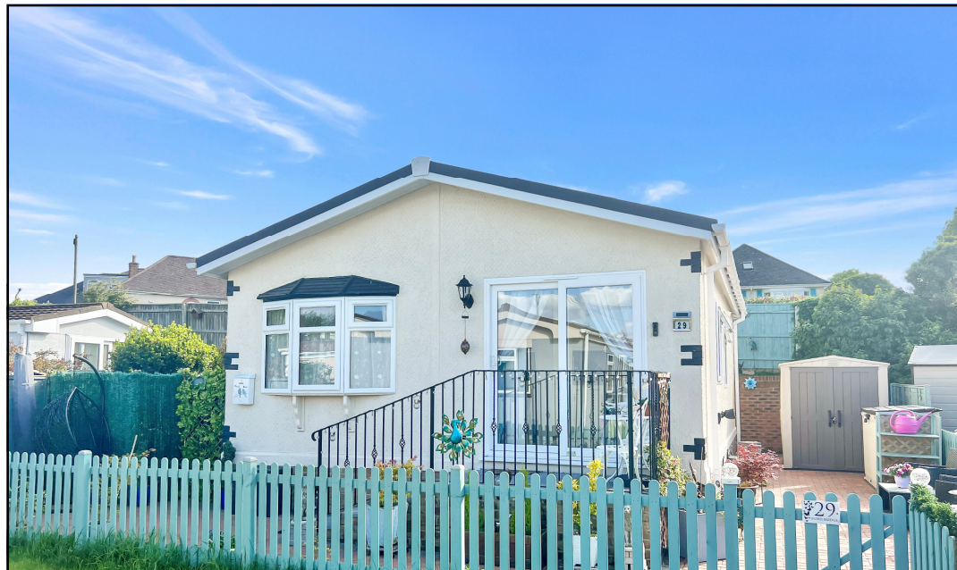
Modern (2022) Park Home in Convenient Location

29 Iford Bridge Park, Old Bridge Road, Iford, Bournemouth. BH6 5RQ